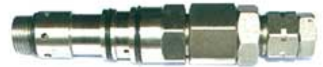
Caterpillar Excavator Series E330 Main Relief Valve