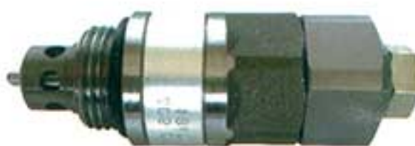
Caterpillar Excavator Series E200B Relief Valve