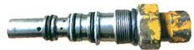
Caterpillar Excavator Series CAT307 Pressure Unload Valve