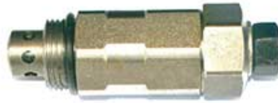
Caterpillar Excavator Series E200B Main Relief Valve