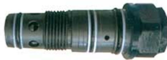
Caterpillar Excavator Series E320B/C Moving Valve