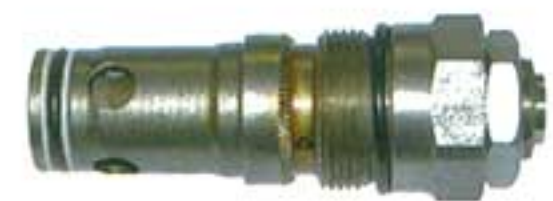
Kato Excavator Series HD250 Main Relief Valve