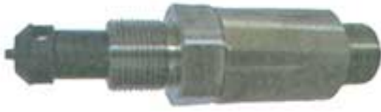
Caterpillar Excavator Series CAT320C Pressure Relief Valve