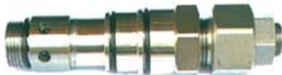
Caterpillar Excavator Series E320B/D Main Relief Valve