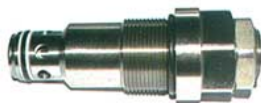
Caterpillar Excavator Series E330 Pressure Relief Valve