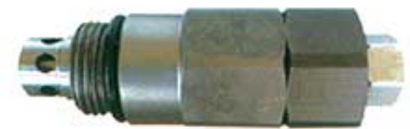
Caterpillar Excavator Series E320B/D Pressure Relief Valve